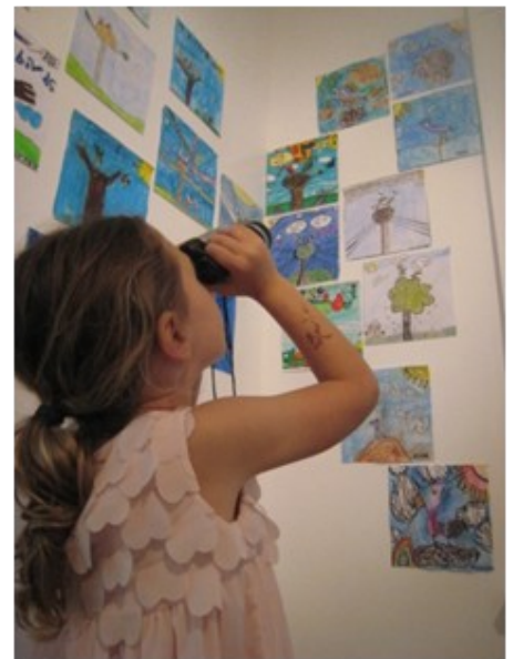
Thea Bird Watching